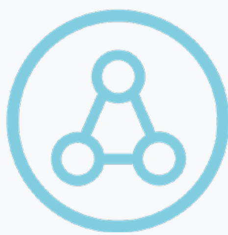
Public infrastructures and social services