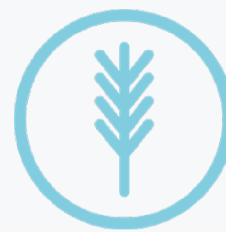
Sustainable food systems