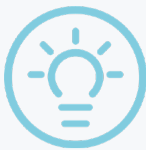
New businesses and labour markets

Urban and rural areas are connected through a variety of functional linkages. ROBUST analyses these relations and interdependencies between rural, peri-urban and urban areas in 5 thematic categories.